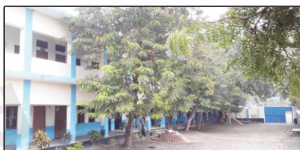
C.P.S. PHARIHA, AZAMGARH Affiliated to State Board