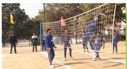
Students Playing Volley-ball