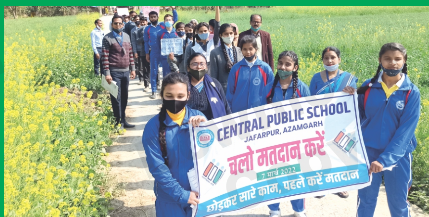
Students participating in Voters Awareness Program