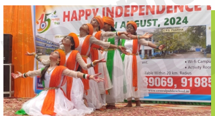
Students Performing in Independence Day Celebration