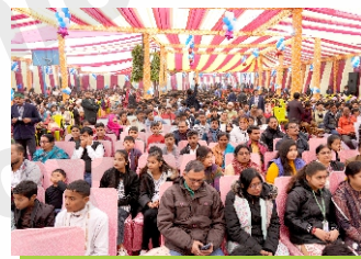
Annual Function Celebration, 2024