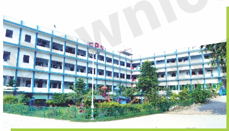
C.P.S. Main Building