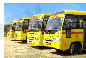
C.P.S. School Buses