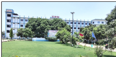
C.P.S. MUBARAKPUR, AZAMGARH Affiliated to C.B.S.E., New Delhi