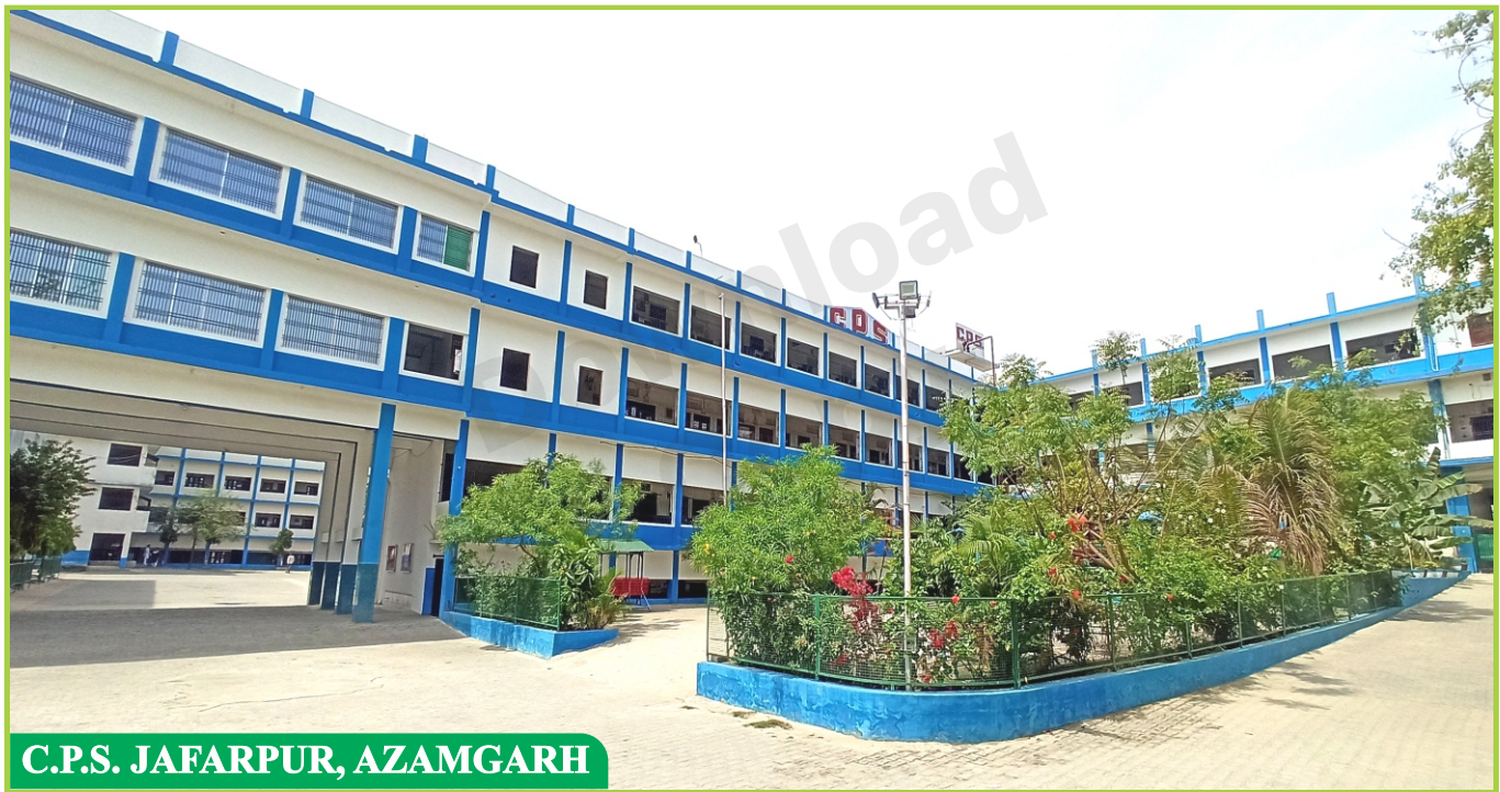
C.P.S. JAFARPUR, AZAMGARH

Email: cps.azh@gmail.com | Visit: www.centralpublicschool.in