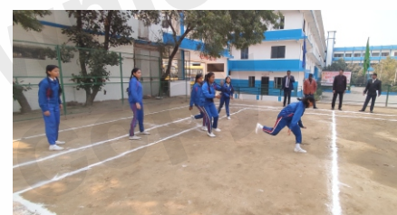
Students Playing Kabaddi