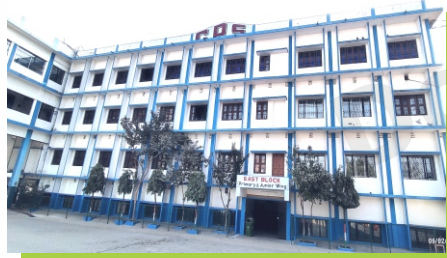
C.P.S. East Block Building