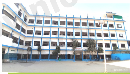
C.P.S. Niyaz Block Building